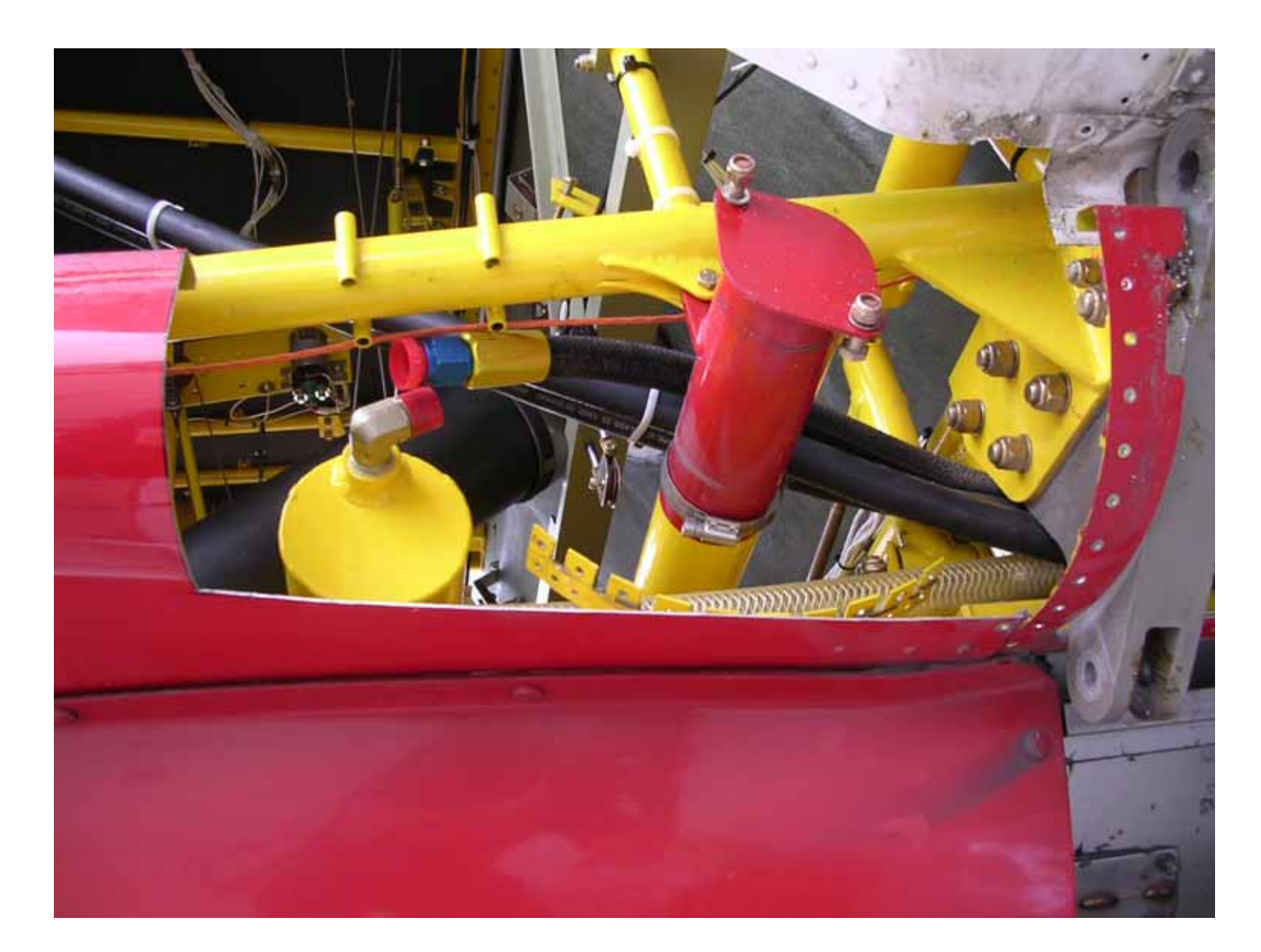
Image #2 Initial opening cut for Access to accomplish Service Kits #50 and #51.

Fax (591) 457-7958 (FouldViscoult States)